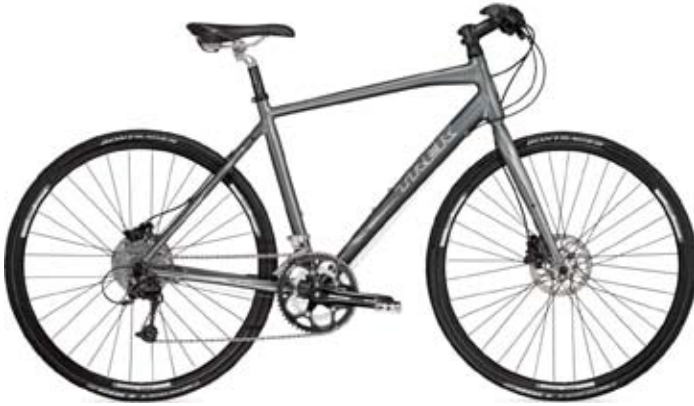
7.5 FX Disc