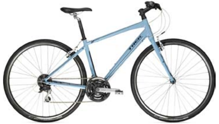
7.2 FX WSD