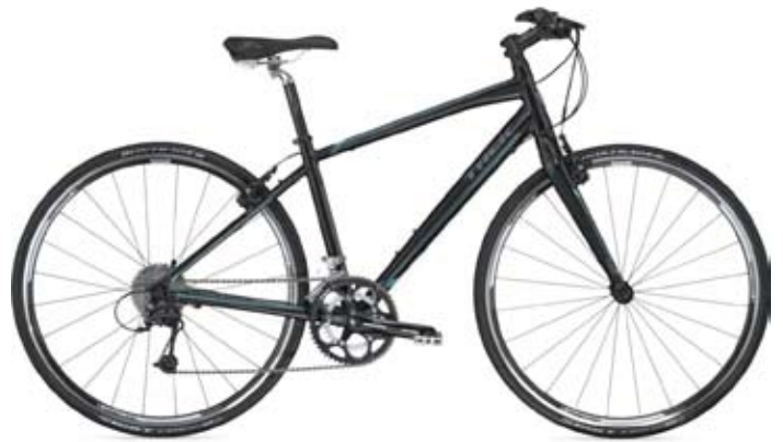
7.5 FX WSD