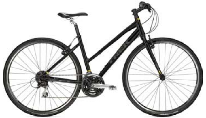
Livestrong FX WSD