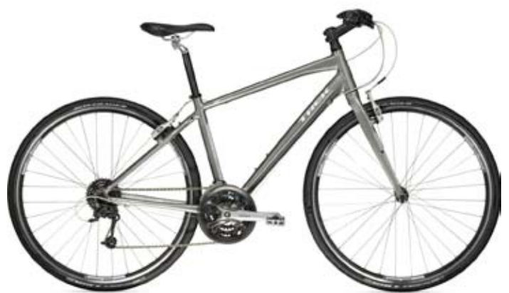
7.3 FX WSD