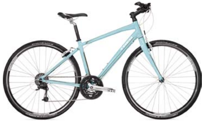
7.4 FX WSD