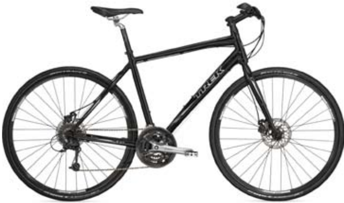
7.3 FX Disc