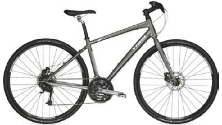
7.3 FX Disc WSD