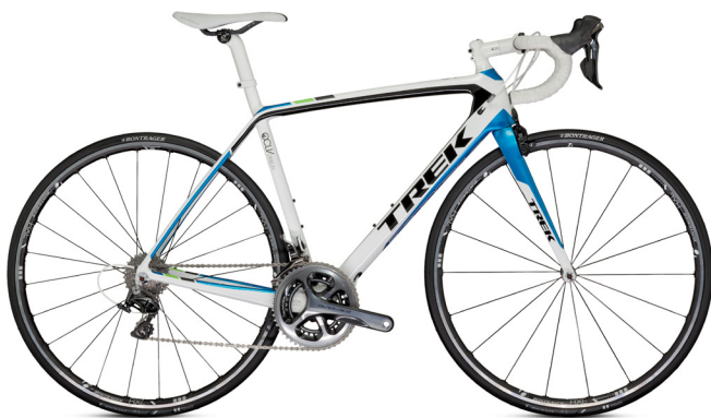
2013 Madone 7.7