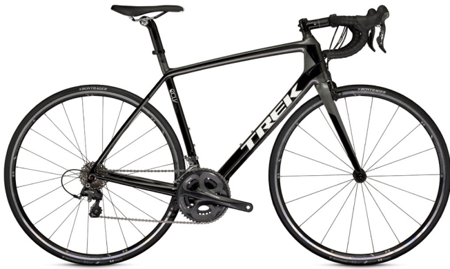
2013 Madone 5.2 & Madone 5.2 WSD