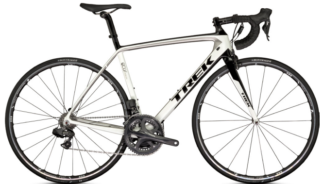
2013 Madone 6.5