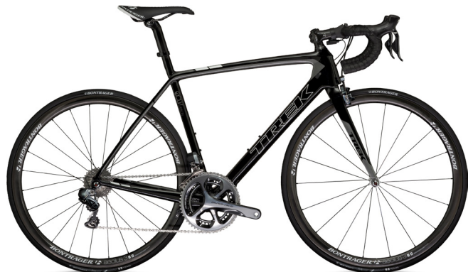
2013 Madone 7.9 & Madone 7.9 WSD