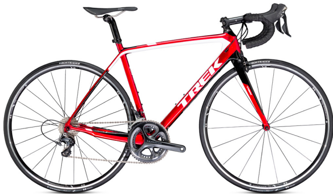
2013 Madone 6.2 & Madone 6.2 WSD