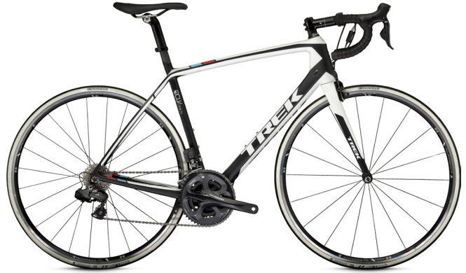
2013 Madone 5.9